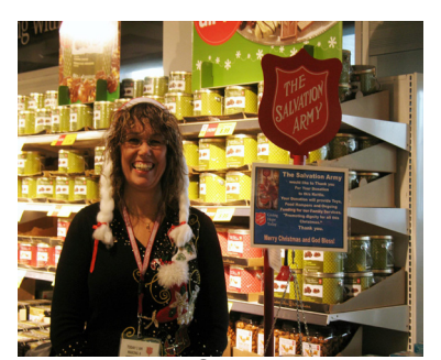
The 2012 LSTAR President was one of the REALTORS® who manned the Salvation Army's Christmas Kettles.