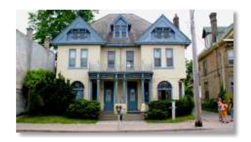
The Unity Project

REALTORS® are strong advocates for home ownership. Not only is it the dream of most Canadians, it's also the bedrock upon which our communities are built, contributing to a strong civic life; economic, business and employment stability; and family security and well being. For some families, however, the dream of home ownership remains elusive. It is for this reason that we must also commit ourselves to providing housing options other than home ownership. Finally, we must acknowledge those Canadians who, for whatever reason, are simply unable to take care of themselves or who require assistance. These people